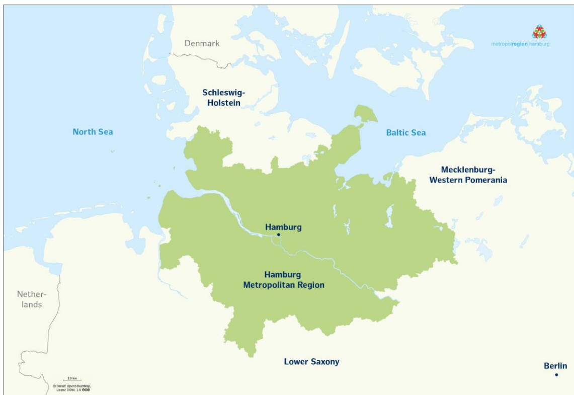
Hamburg Metropolitan Region Data: OpenStreetMap, Lizenz ODbL 1.0 1