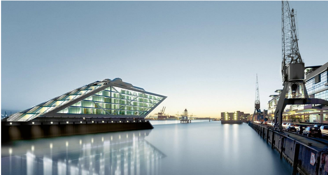
Dockland Hamburg

Hamburg is China’s gateway to Europe and serves as the central hub for the New Silk Road – both on land and by sea. China has been Germany’s number one trading partner since 2016. In 2017 alone, the bilateral trade volume amounted to more than €187 billion. Today, more than 50 percent of German foreign trade with the People’s Republic of China is handled in the port of Hamburg, with more than 2.6 million container units (TEU) handled in 2017. Accounting for about one third of the volume of all containers handled in Hamburg, China is the number one foreign trade partner of Hamburg’s port. In addition, the number of direct freight train connections between Hamburg and China is increasing steadily. Each week, there are some 230 container train connections between Hamburg and China. Trade ties between Hamburg and China go back to the era of the Hanseatic League. In 1986, Hamburg was the first European city to twin with Shanghai, and the two cities continue to foster their lively partnership.