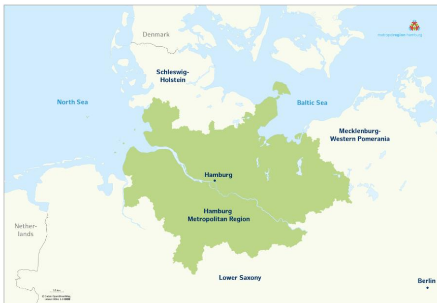
Hamburg Metropolitan Region Data: OpenStreetMap, Lizenz ODbL 1.0 1