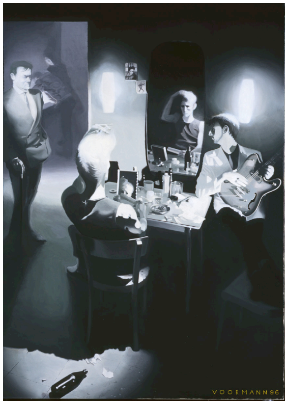
kaiserkeller dressing room © artwork b klaus voormann